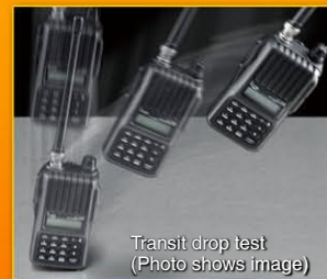
Transit drop test (Photo shows image)