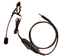
NMN6246 Ultra-Light headset w/Boom Mic and in-line PTT