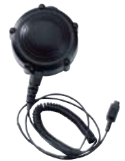
0180300E83 Remote Body PTT Switch for Ear Mic