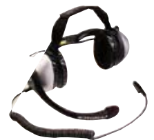
RMN5015 Racing Headset - Heavy Duty