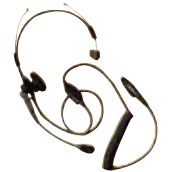
JMMN4066 Lightweight Headset w/ Boom Mic and in-line PTT