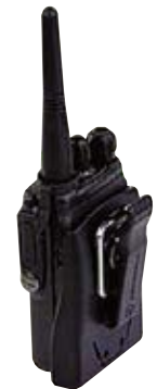
JMZN4023 Plastic Carry Holder w/Belt-clip