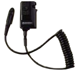
JMMN4064 Ear Mic VOX/PTT Interface Module