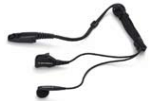
PMLN4519 Earbud with combined Mic/PTT