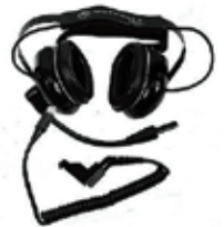
BDN6645 Heavy Duty Noise Cancelling Boom Mic w/ PTT Earcup