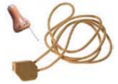
RLN4922 Wireless Discreet Earpiece