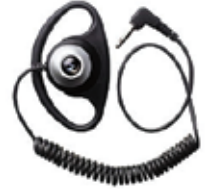
PMLN4620 D-Shell RSM Earpiece