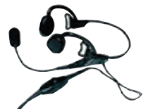
PMLN4585 Temple Transducer Headset